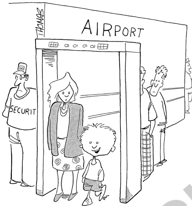
Cartoons B–C: © Cartoonstock

"Wow, this is the same model we have in school."