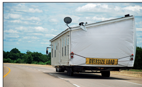
Half a house on the road

(can/do) This move _____ only _____ during night-time. I hope, people can watch movies again in the old cinema in Houston next month.