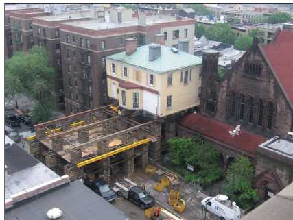
Moving of the Alexander Hamilton House