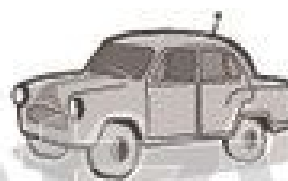
a car no