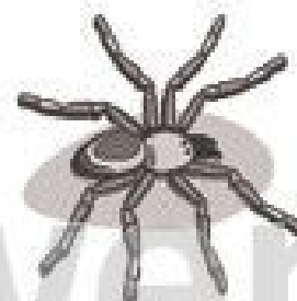
a spider no