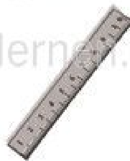
a ruler yes