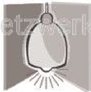
a lamp yes