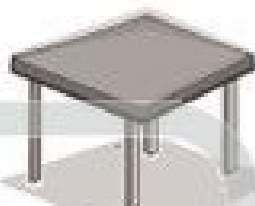
a table yes