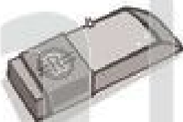
a rubber yes