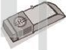
① a rubber

Sind sie nicht im Klassenraum? Dann schreib "no".