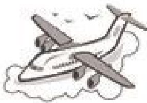
② a plane