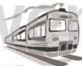
a train no