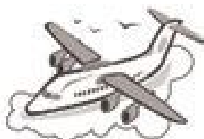
a plane no