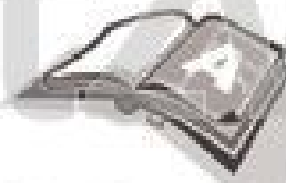
a book yes