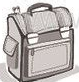
a satchel yes