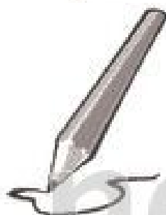
a pencil yes