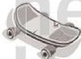
a skateboard no