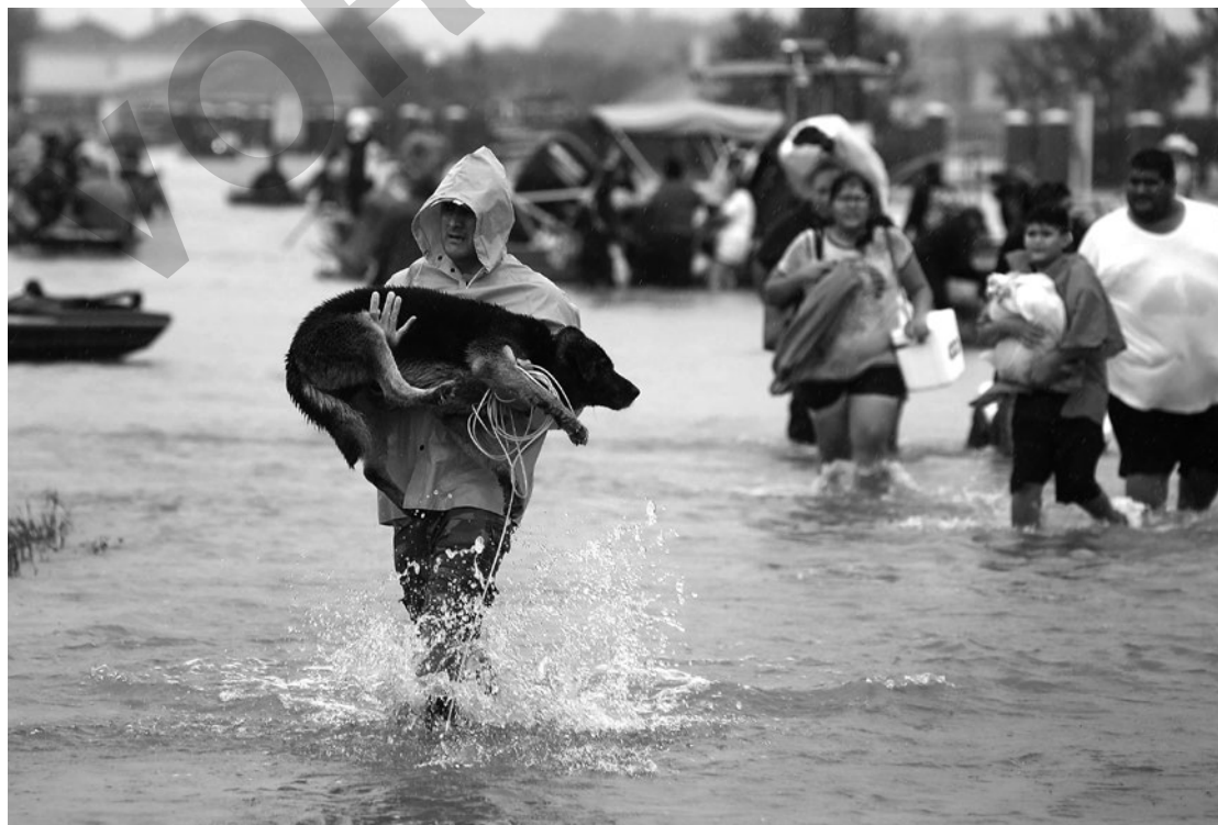
People escaping their flooded homes in Houston, Texas, after Hurricane Harvey struck in 2017.