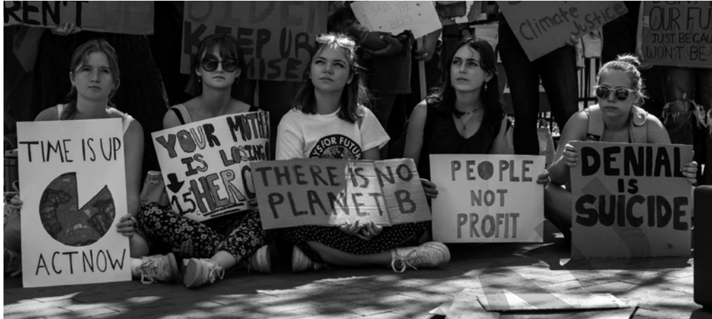
Students protest at the White House as part of Fridays for Future's Earth Day climate strike in April 2022.

CLIMATE ANXIETY Barack Obama may have struck a gloomy tone, but that sense is amplified for those in imminent peril.