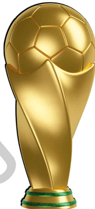
FIFA WORLD CUP 2014, Brazil

The German player Mario Götze immediately controlled the ball on his chest and volleyed it with his left foot into the Argentinian goal. This fantastic hit was the only goal in this encounter. The German team won the football match against Argentina 1-0 and became World Champion for the fourth time.