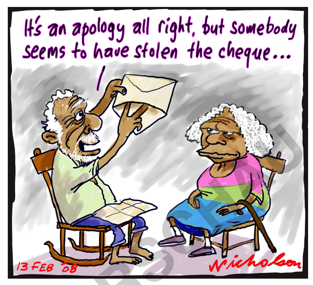
© Cartoon by Nicholson from The Australian www.nicholsoncartoons.com.au