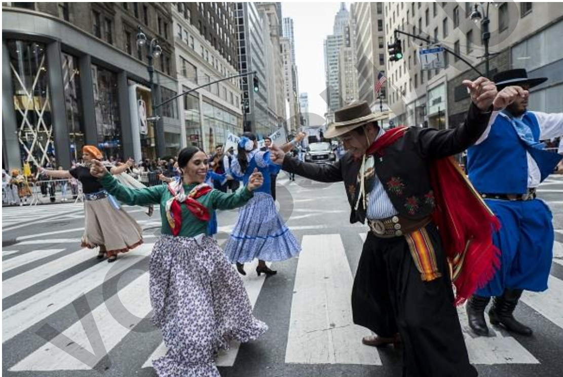
| Marchers dance together down 5th Avenue, Manhattan, New York, in traditional costumes during the 55th Hispanic Day Parade.

Inhalt: Diese Radiosendung besteht aus einem Interview mit dem neuen Interimsdirektor des geplanten National Museum of the American Latino. Der Beitrag beschäftigt sich mit der Bedeutung der lateinamerikanischen Bevölkerung für Geschichte, Kultur und Gegenwart der USA.