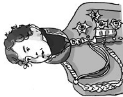
King George IV