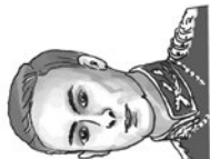
King George VI